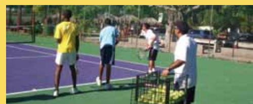
The four tennis courts on campus received an extensive facelift thanks to Russell Tennis Academy.

Great care was taken to ensure the accuracy of this list, please alert us to any errors or omissions. List inclusive of buyers of bricks between October 1, 2010 and October 31, 2011.