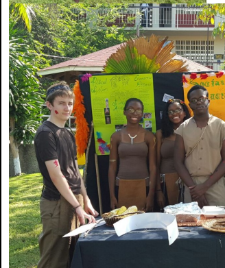
A FEW PHOTOS OF HERITAGE DAY 2015