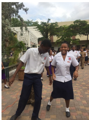
Head Boy & Head Girl having fun at the recent Big Brother & Sister Social