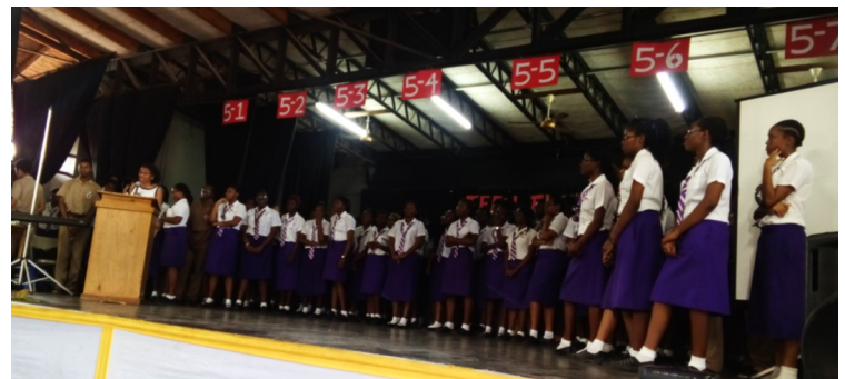
FIFTH FORM FINAL ASSEMBLY 2016