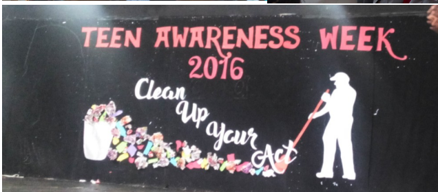
TEEN AWARENESS WEEK